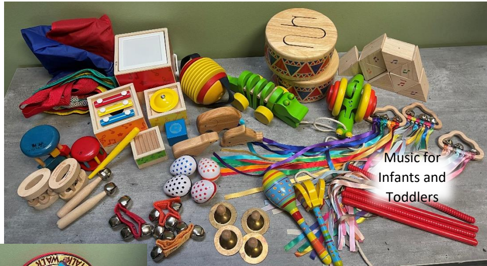
Music for Infants and Toddlers