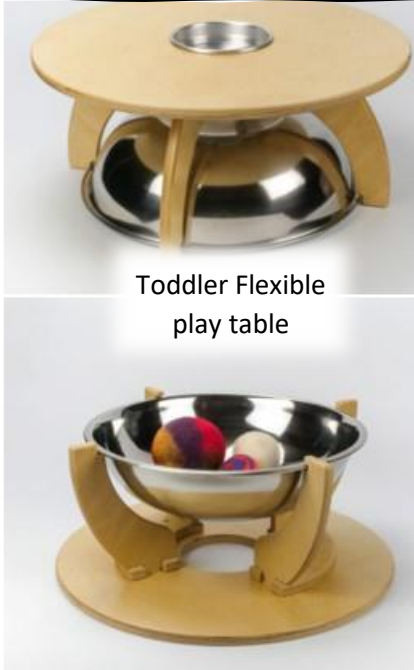
Toddler Flexible play table