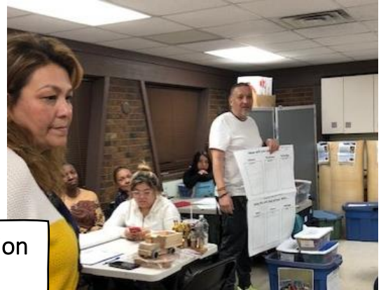
Curriculum in Action Training February 15