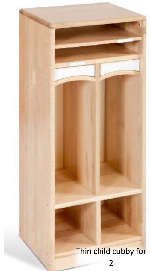
Thin child cubby for 2