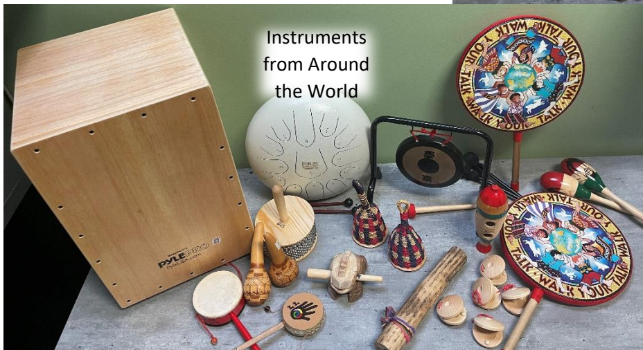
Instruments from Around the World

NEW and UPDATED CURRICULUM UNITS Link to Unit and Equipment List