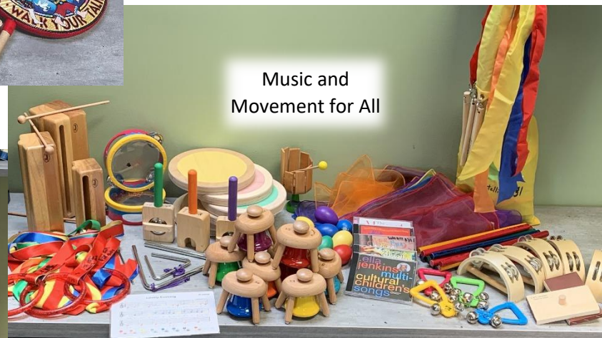
Music and Movement for All

NEW and UPDATED CURRICULUM UNITS Link to Unit and Equipment List