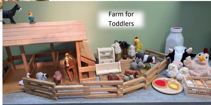
Farm for Toddlers