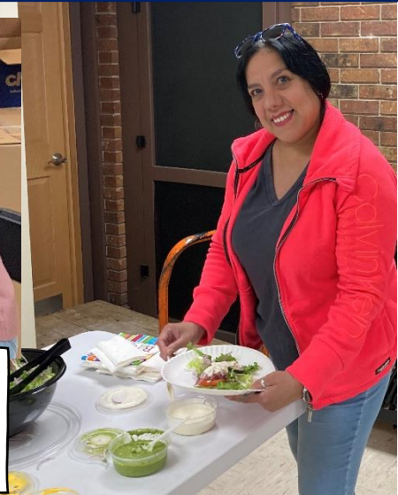
Latino Provider Night March 15